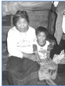
Photo 1. A resident of the Leprosy Village