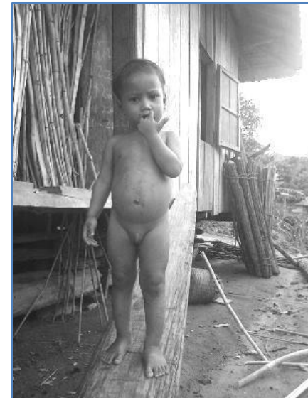
A remote village child: Will he go to school?

Starting in August 2010 we will add 10 more children to our VILLAGE EDUCATION Project. With this inclusion the project will be at 39 kids in 11 villages. These are children who would not have had a chance to go to school because they were far too poor. We hope this program will expand even further as commitments from sponsors increase.