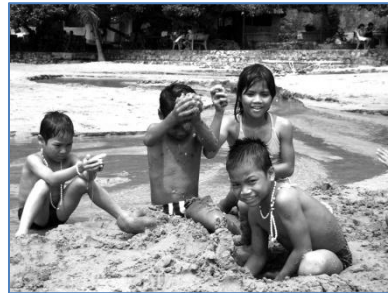
BEACH TRIP 2010