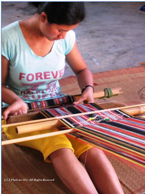
Counting the stitches carefully