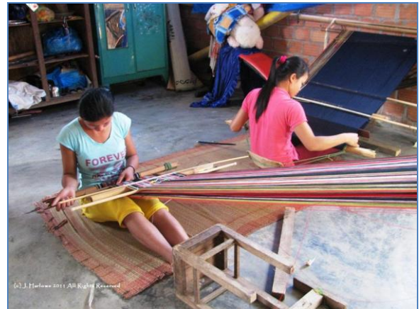
The length of cloth will take over a week to fabricate

The girls train 8 hours a day. They live and sleep and eat in this room. But if they learn this craft carefully they will have a lifetime of employment.