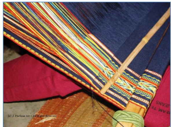
Another look at the traditional tools