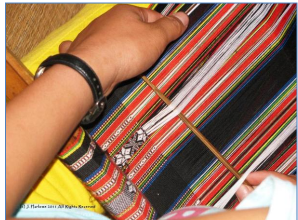
Traditional bamboo needles are used